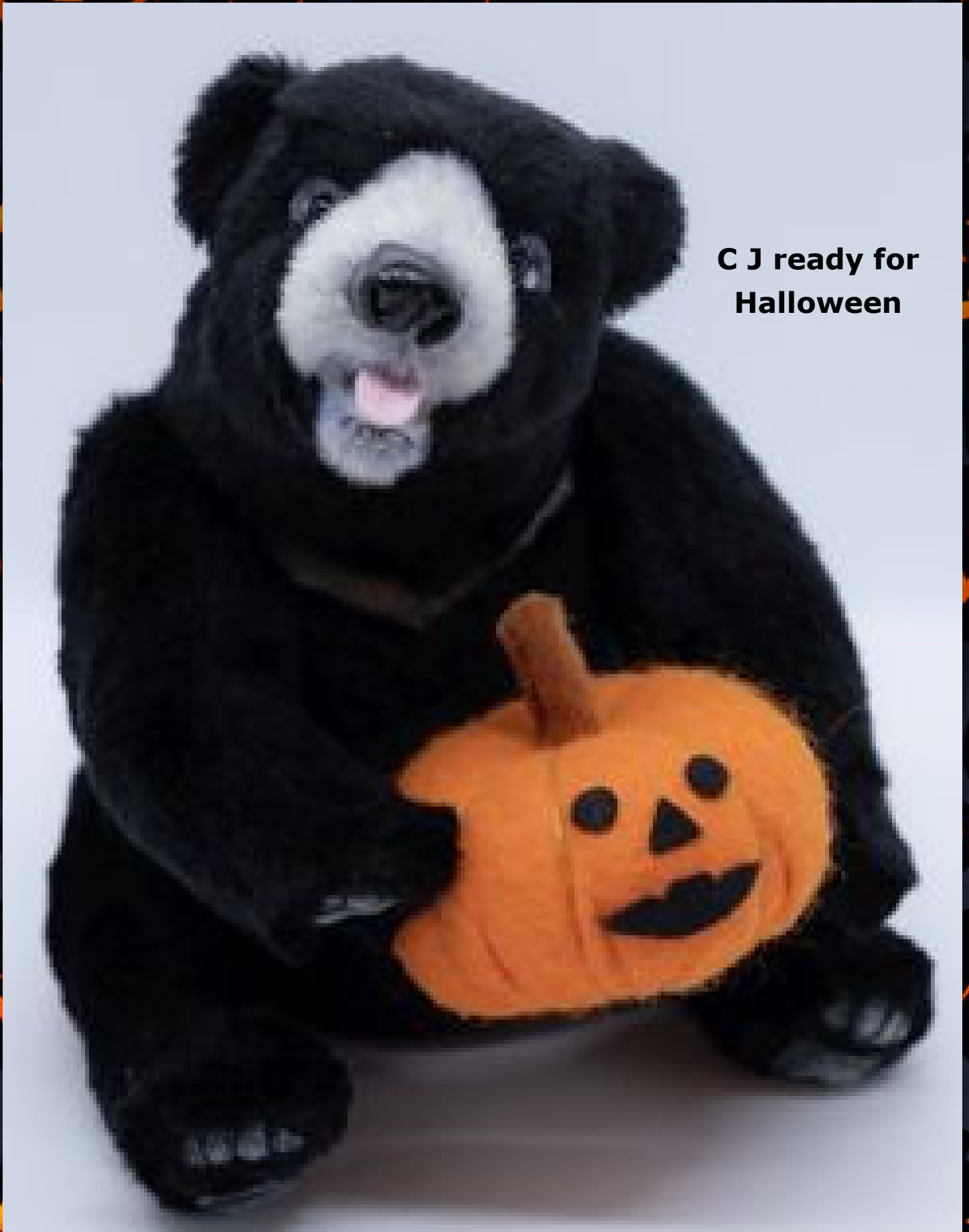
C J ready for Halloween